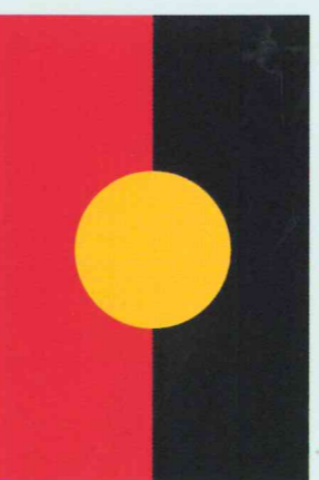
Australian Aboriginal Flag

The Australian National Flag is a symbol of the entire nation. Australians also recognise other important flags, such as the state and territory flags, the Australian Aboriginal Flag, the Torres Strait Islander Flag, and the ensigns of the Australian Defence Force.